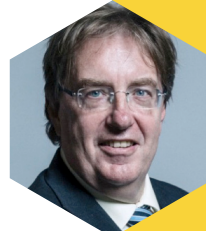
John Howell Conservative MP for Henley Co-Chair, All Party Parliamentary Design and Innovation Group (APDIG)