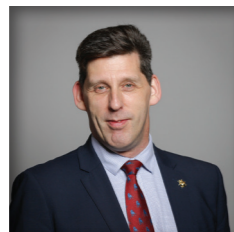
Lord Duncan of Springbank Lord Duncan of Springbank Former Climate Change Minister Conservative Party

As the roundtable discussions highlighted, the transition to low carbon heat will make people's lives more comfortable. Besides environmental improvements, it will deliver health benefits, more cosy homes, and if managed well, reduced levels of fuel poverty. To unlock these co-benefits, the vision for heat decarbonisation we hope to see laid out in the Heat and Buildings Strategy needs to have a well-designed implementation plan. This publication aims to help build the foundations for a harmonised heat strategy and facilitate its implementation.