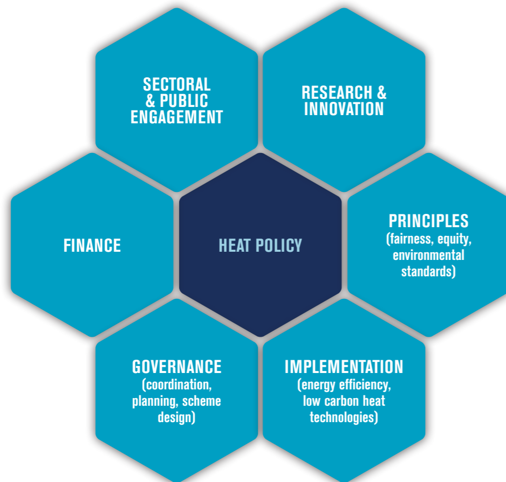
Figure 2: Going forward: a systematic long-term heat policy trajectory

Given the cross-sectoral engagement needed between consumers, industry, research and various levels of the government, the Heat and Buildings Strategy must incentivise all stakeholders that are needed to take action for effective heat decarbonisation.