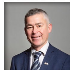
Alan Brown MP Alan Brown MP Energy and Climate Change Spokesperson for SNP