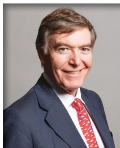
Rt Hon Philip Dunne MP (Conservative)