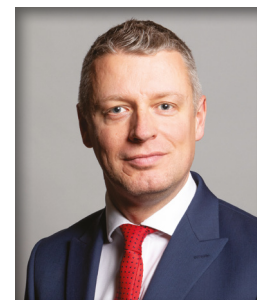
Luke Pollard MP (Labour)