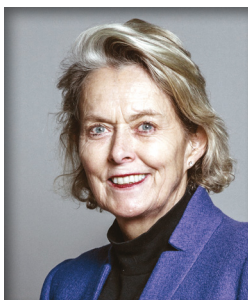
Baroness McIntosh of Pickering (Conservative)