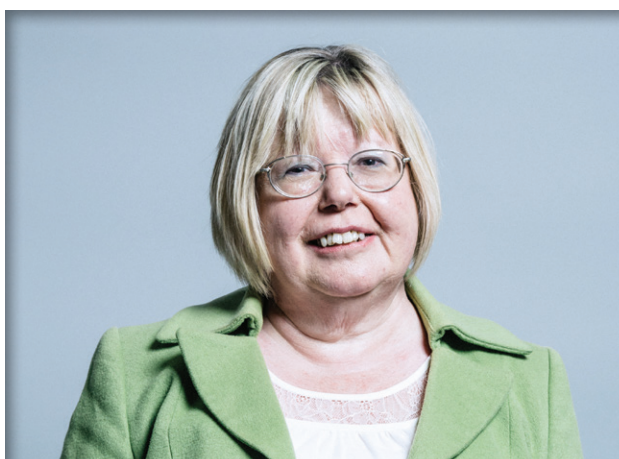
Liz Twist MP